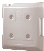
va-Q-accu -21G -25 °C to -15 °C