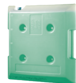
va-Q-accu +22G +15 °C to +25 °C

Other temperature ranges available on request.