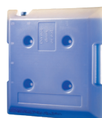
va-Q-accu +05G +2 °C to +8 °C