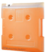
va-Q-accu -32G -35 °C to -25 °C